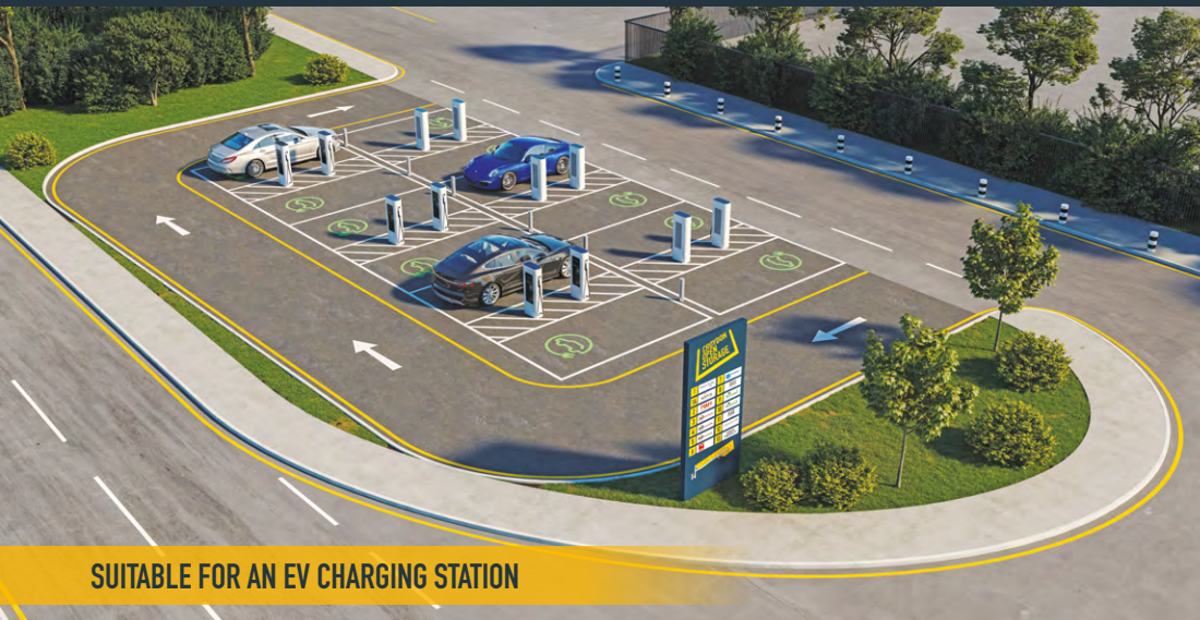
SUITABLE FOR AN EV CHARGING STATION