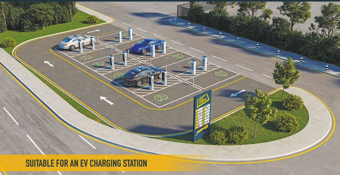
SUITABLE FOR AN EV CHARGING STATION